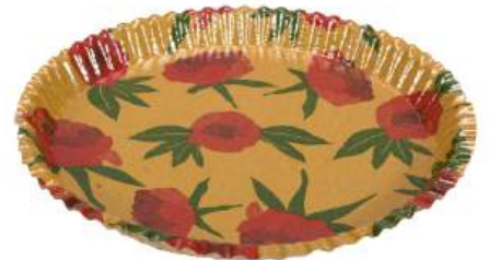
CORRUGATED BIO COATED BUFFET PLATE - 14 INCH+WHITE BACK

SIZE - 12.5 INCH CODE : SSPPS12.5 PACK SIZE - 22 PCS