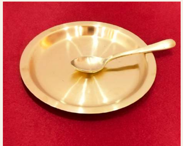
MATT FINISH SIZE : 6" DIA