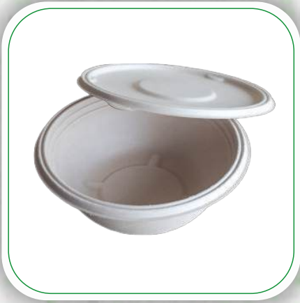
500ML ROUND CONTAINER LID.