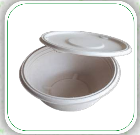
1000ML ROUND CONTAINER LID.