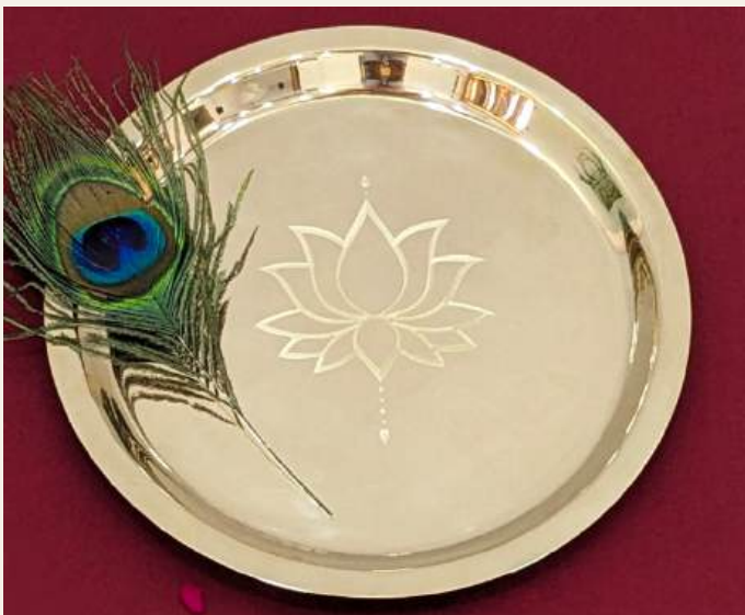
GLOSSY FINISH SIZE : 9" DIA