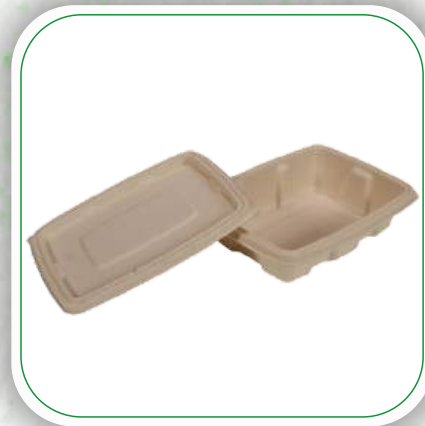
750ML RECTANGULAR ROUND CONTAINER LID.