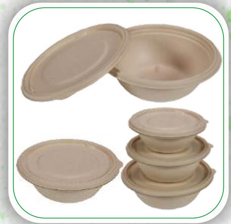
1000ML ROUND CONTAINER