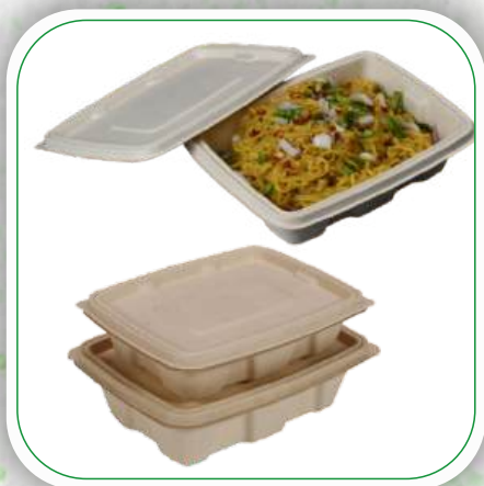
500ML RECTANGULAR CONTAINER