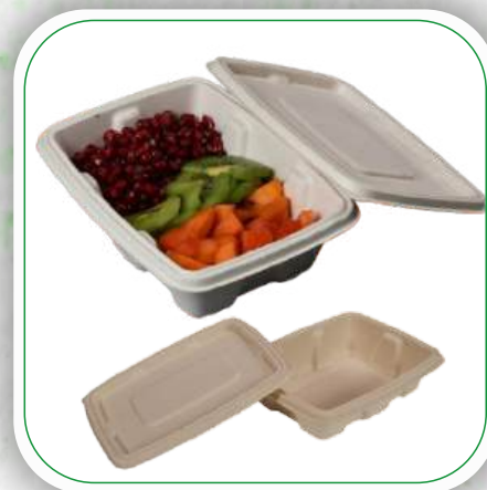
750ML RECTANGULAR ROUND CONTAINER