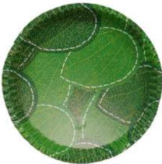
BIO COATED PLATES VIRGIN SBS

SIZE - 14 INCH CODE : SSPPB14 PACK SIZE - 22 PCS