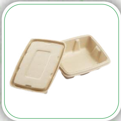
500ML RECTANGULAR CONTAINER LID.