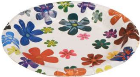
CORRUGATED BIO COATED BUFFET PLATE

SIZE - 12.5 INCH CODE : SSPPB12.5 PACK SIZE - 22 PCS