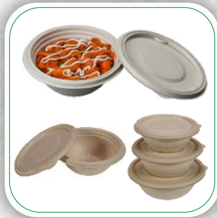
750ML ROUND CONTAINER