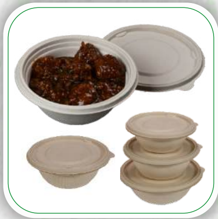
500ML ROUND CONTAINER